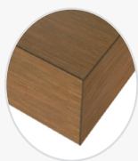
1001 Self Laminate