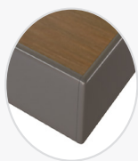
1003 3mm Laminate

See resources page for additional information on finish materials, grades, and selections.