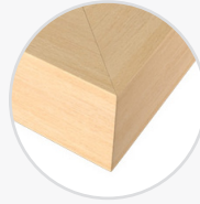
4014 Solid Wood Veneer