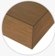
1001 Self Laminate