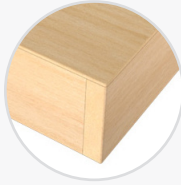
3008 3mm Wood Edge Veneer