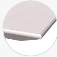
1901 Knife Bottom Bevel PVC 3mm Edge Laminate