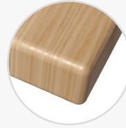
5121 Solid Wood