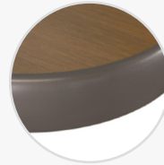
1104 T-Mold Laminate