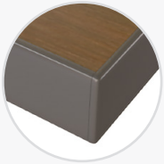
1003 3mm Laminate

See resources page for additional information on finish materials, grades, and selections.