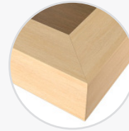
2014 Solid Wood Edge Laminate